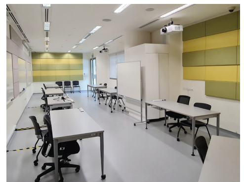
Systems Design Studio (1.615)

The Data Analytics Lab is where computational power meets systems thinking. This is the ESD home for simulation, optimisation, and analysis. It began life as a Trading Lab, simulating the research and trading activities of a financial professional. It is equipped with Bloomberg terminals giving you access to a wealth of up-to-date financial information on publicly traded firms. It also features a display board with running updates of current stock prices. But the lab has grown to embrace statistical analysis of large datasets, simulation of complex facilities, and optimisation of large scale multi-objective planning and design problems. It provides the latest tools that cover all three aspects of data analytics – descriptive, predictive and prescriptive analytics. We also host interactive, computer-based games where teams of students tackle realistic, fast-paced operational challenges such as bringing a large development project to completion on time and under budget in spite of disruptive events. This is the place to hone your computational and decision-making skills.