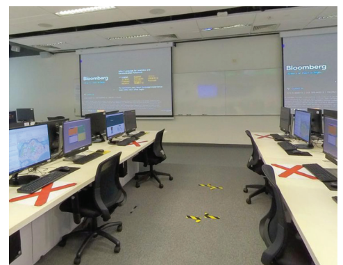
Data Analytics Lab (1.610)